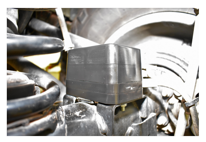
3" Bump Stop Configuration Pictured